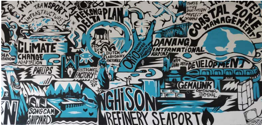
Artwork showcased in the break room of the sustainable and infrastructural achievements of Royal HaskoningDHV in VN.