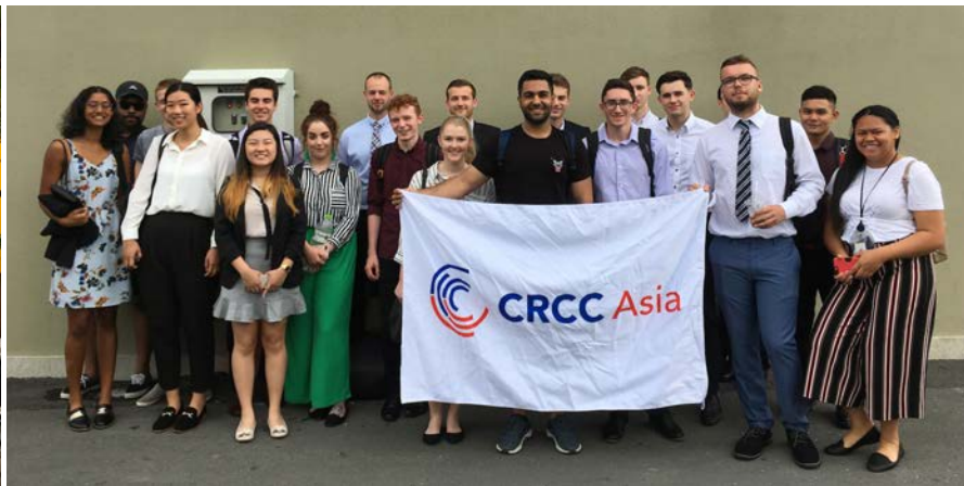
CRCC Asia, Ho Chi Minh City Interns of 2018, July - August. I am the ginger one in the centre, in the image to the right.